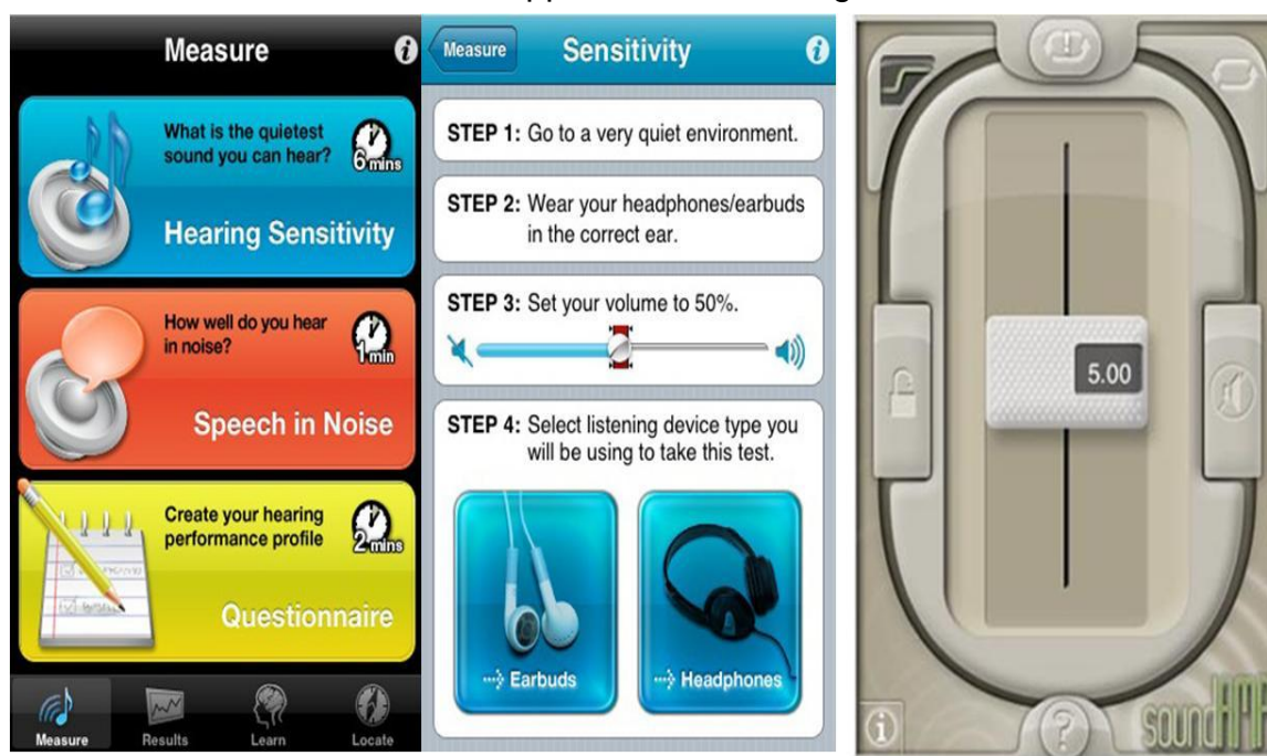
Figure 2 Screenshots from the Uhear and SoundAMP Apps

There will soon be nearly 2 million people in the UK with a visual disability, many of whom have cataracts and age-related macular degenerative disease. Many other older people struggle to read small print and to see the outlines of shapes. Good lighting, magnifying glasses and speaking devices can help to compensate for their deficiency. Figure 1 shows screenshots from a smart phone using the digital camera to enlarge labels for easy reading, and to identify the colour of objects by comparison with a standard palette. This can also help the 8% of people who are believed to be colour blind. Other apps can be used for prescribing reading glasses and to identify objects. Similarly, It is estimated that there are 8.7 million people with a hearing impairment in the UK but less than half are prepared to wear an electronic hearing aid at all times. Many have not been properly tested, perhaps as a result of the difficulties in having a test performed. The Uhear app is a clever self- administered test that can be used for digital hearing aid prescriptions. However, a separate device may not be needed if the SoundAMP app is employed to amplify speech and to make it clearer. It has a 30 second replay button which allows the user to hear again the words that they might initially have missed. Screenshots from these apps are shown in Figure 2.