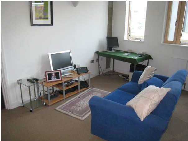
Lounge with technology for connecting people.