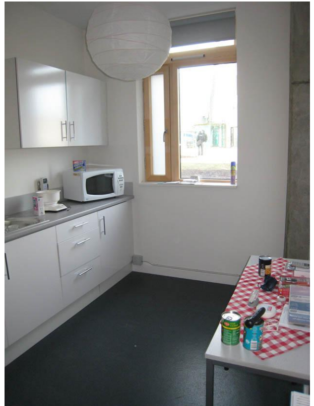
Kitchen showing aids for blind and partially sighted people.

The New space allocated for the CUHTec demonstration home in the new Computer Science Department has now been furnished with assistive technology demonstrations. CUHTec is looking for further demonstrations from industry and researchers.